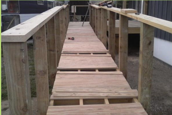
Elevated Timber Platform access

Currently the access to the deck is being completed and the second image shows the front elevation as at 17 May 2017.