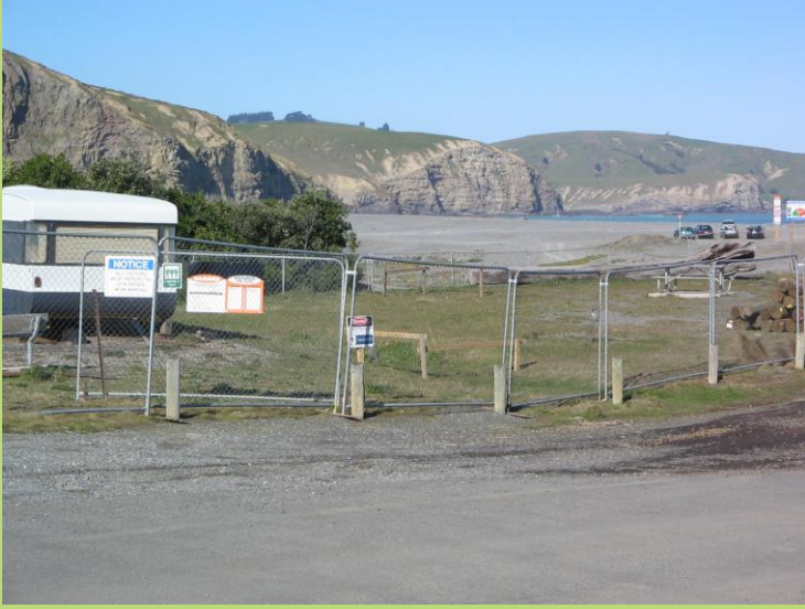
Designation of site for Birdlings Flat Community Centre