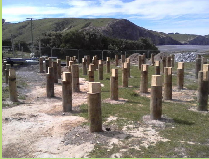
Foundation completion on site