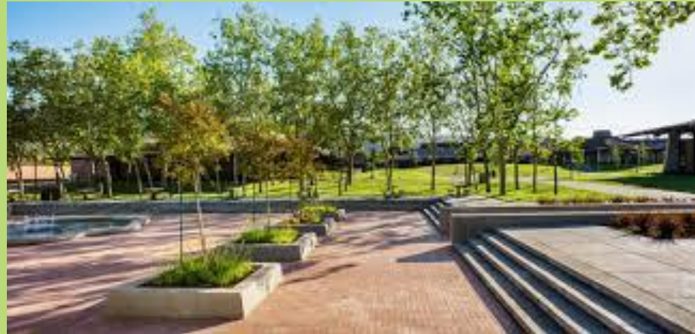
IMAGE OF CARPARKING AND CENTRAL SQUARE WITH WATER FEATURE – POOLS OR FOUNTAIN

Some clear ideas that could be utilised to enhance the otherwise mundane look of the settlement which have been used elsewhere.