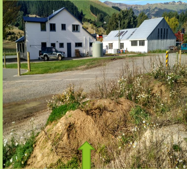
ADDITIONAL LANDSCAPED CAR PARKING

EXISTING RECYCLING CENTRE TO BE CONVERTED TO MULTI FUNCTION COMMUNITY SERVICE CENTRE INCLUDED MEDICAL SERVICES, BIKE EVENTS, ART EXHIBITION , MUSICAL MEETINGS ETC.