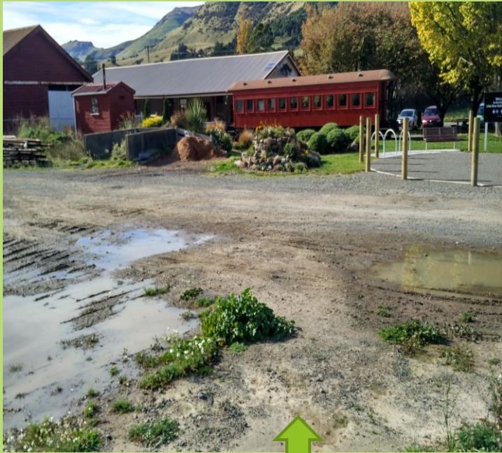
VILLAGE CENTRAL SQUARE WITH WATER FEATURES